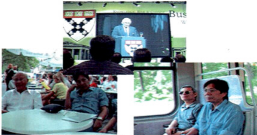
Members of our club networking with the members of the various clubs all over the world

The HBS Global Alumni Conference was held from 13-16 June 2000 at Berlin, Germany. The theme of the conference was "Business without Walls". The Conference provided good opportunity for networking. Talks on various subjects of the interest were the highlights of the meeting.